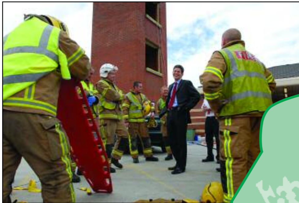
Meeting the team at the Fire Station, South Shields

On behalf of the residents of South Shields, I would like to say a big thank you to them all.